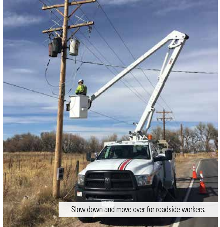
Slow down and move over for roadside workers.

We thank you for helping keep our crews safe!